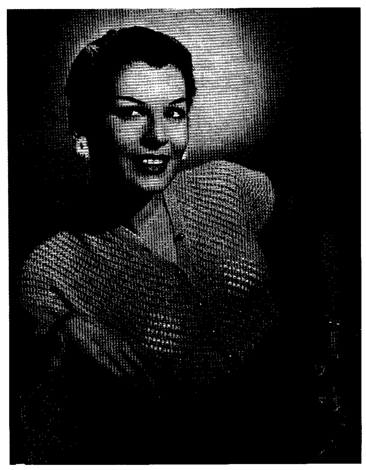
*Cynthia* LACY PATTERN EVENING BLOUSE