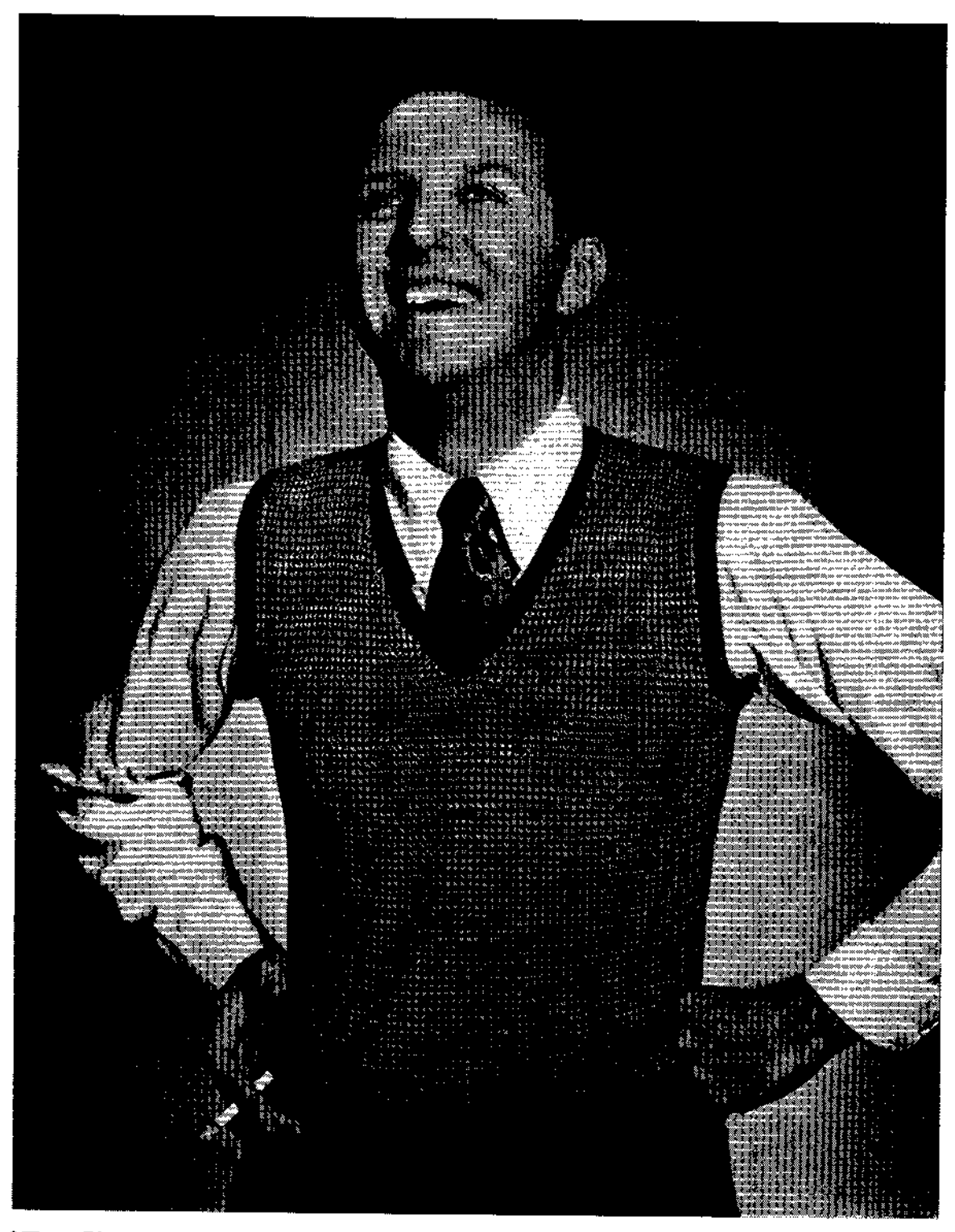
*Paul* TWO-TONE PATTERN SLEEVELESS JUMPER