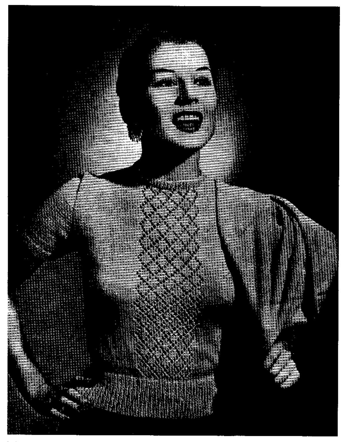
"Jeanette" STOCKING & DIAMOND STITCH JUMPER