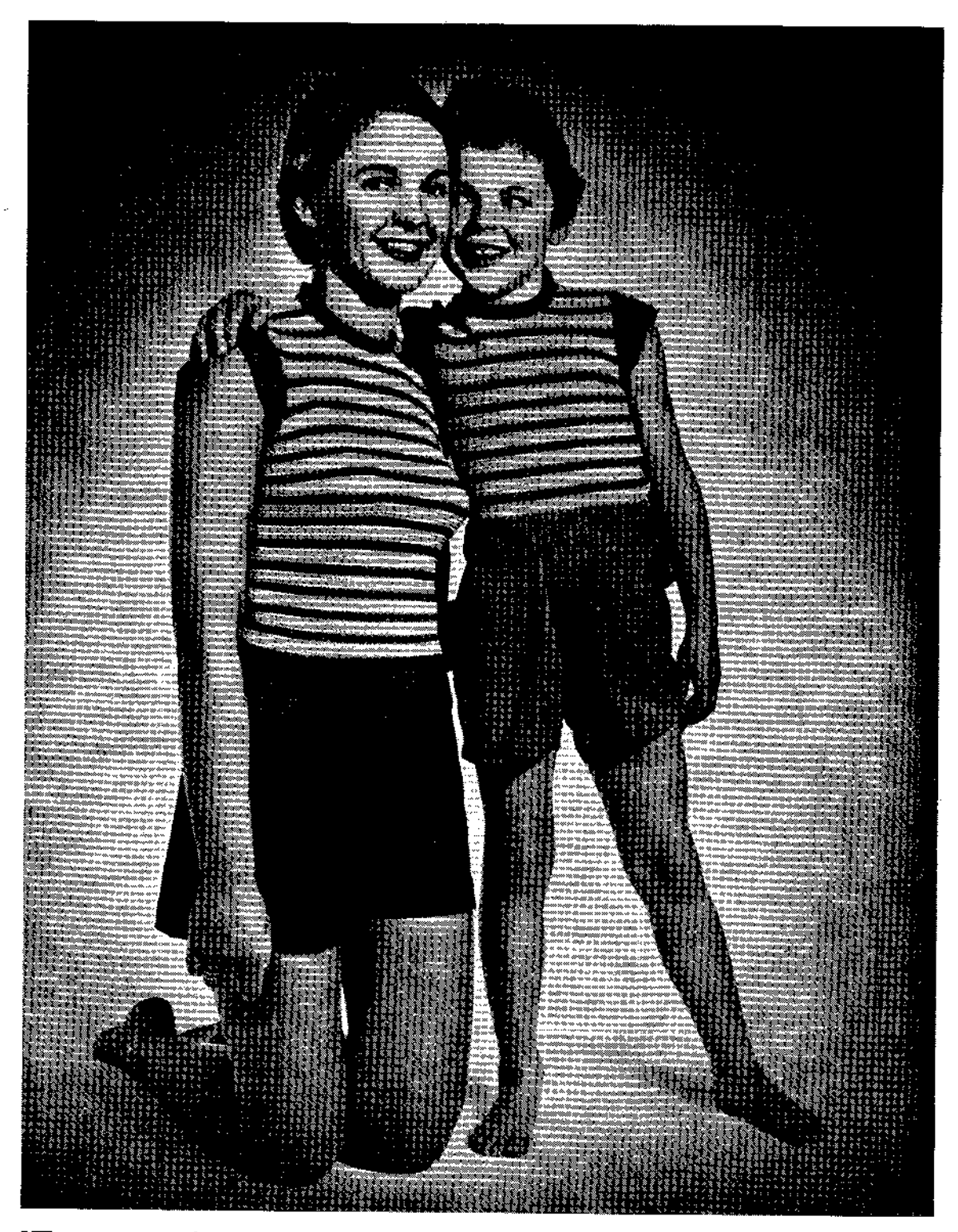
"Two-some" STRIPED GARTER STITCH SLIPONS